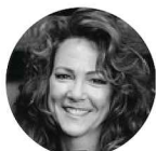
MICHELE SMITH Softball Olympic Gold Medalist & ESPN Analyst